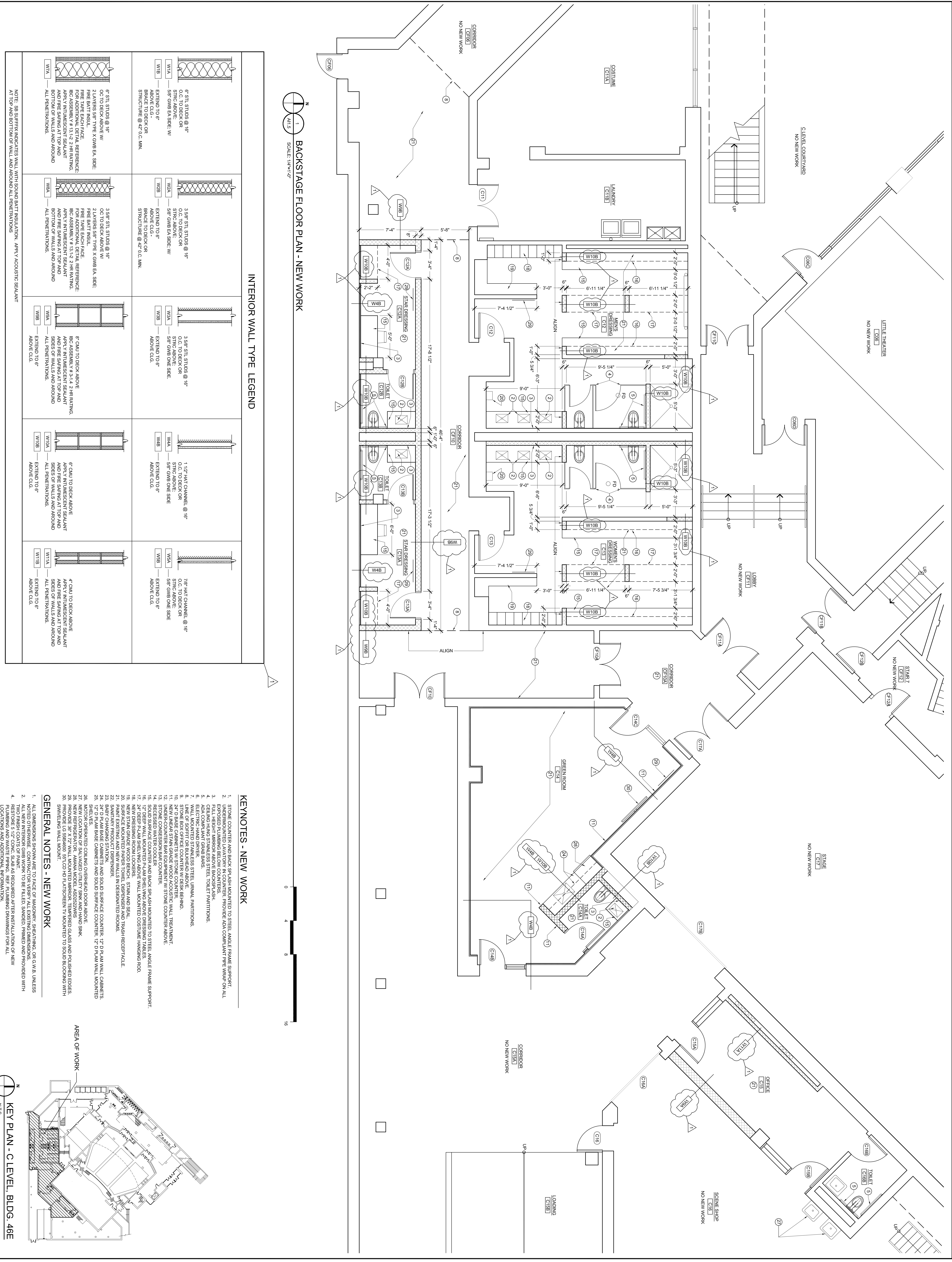
BACKSTAGE FLOOR PLAN - NEW WORK SCALE: 1/8"=1'-0"