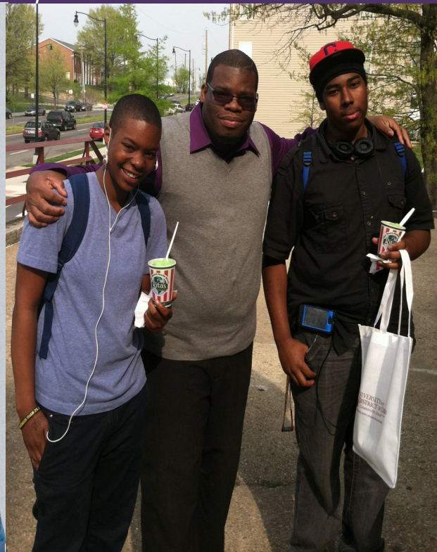
Rita's Italian Ice visit students at Marion Shadd Educational Center.