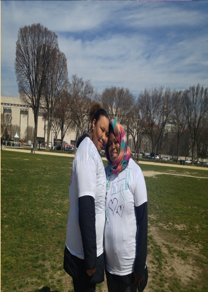
Students participated as a Human Clothesline for a domestic violence project.