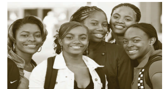
Believe it and achieve it.