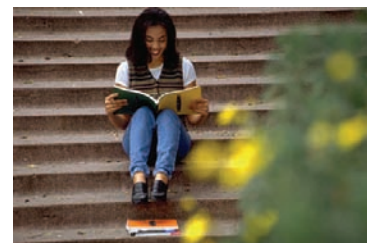
BOOK WORM CORNER

Stories abound about the abolition of slavery. However, lesser known are the efforts -- both prior to and after the Civil War -- of African American and white abolitionists banding together to formally educate newly freed slaves. Through the tireless work of government organizations, black churches, missionary groups, and philanthropists, HBCUs were established. The tales of how these schools were created and of the individuals who are linked to the schools' histories are extraordinarily rich -- and sometimes controversial. In an unprecedented salute to America's 107 historically black colleges and universities, I'll Find a Way or Make One chronicles the formation of the black middle class, the history of education in the African American community, and some of the most important events of African Americana and American history. (Source: Harper Collins)